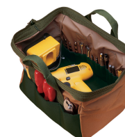
GateMouth Jr. $24.45 - $16.99 Save: 31% off